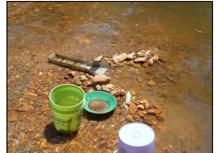
The little sluice that could.